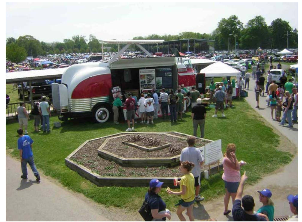
Futurliner Display at Rhinebeck, NY

GM Futurliner Restoration Project (See more on our web site: <a href="https://www.Futurliner.org">www.Futurliner.org</a>) Newsletter #38 October – 2010