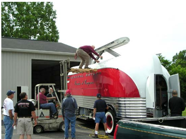
June 2010 Work Session